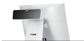
Customer Display • VFD (2 Lines x 20 Characters)