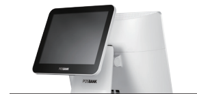
2nd Display • 9.7", 12.1", 15" LCD