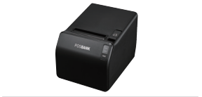
POS Printers • A7, A11